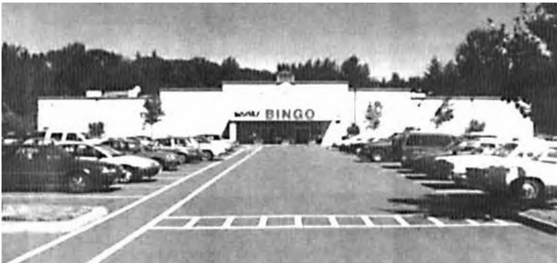
20,000 sq ft Imperials Bingo Hall, Renton, Washington

The Imperials Bingo Hall is a 20,000 square foot structure built in 1994 in Renton, Washington, USA, by Imperials Music and Youth Association. Although significantly remodeled in 2004, the building was originally divided into two bingo rooms, one non-smoking and an 8,000 square foot smoking section for up to 400 bingo players. There are also administrative offices, kitchen, restrooms, loading and storage areas. A floor-to-ceiling partition wall separates the bingo hall, which is all smoking, and the new “mini-casino” and restaurant. The suspended ceiling is 14 feet from the floor.